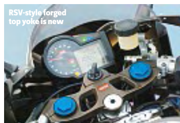
RSV-style forged top yoke is new

It may come as some surprise that Aprilia's iconic RS125, the definitive seventeener screamer, is now in its 14th year of production. Yet throughout all that time, through countless updates and improvements, it's remained the learner racer-replica of choice. And Aprilia want to keep it that way – which is why it's received a whole load of improvements for 2006.