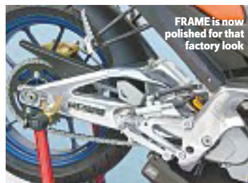
FRAME is now polished for that factory look