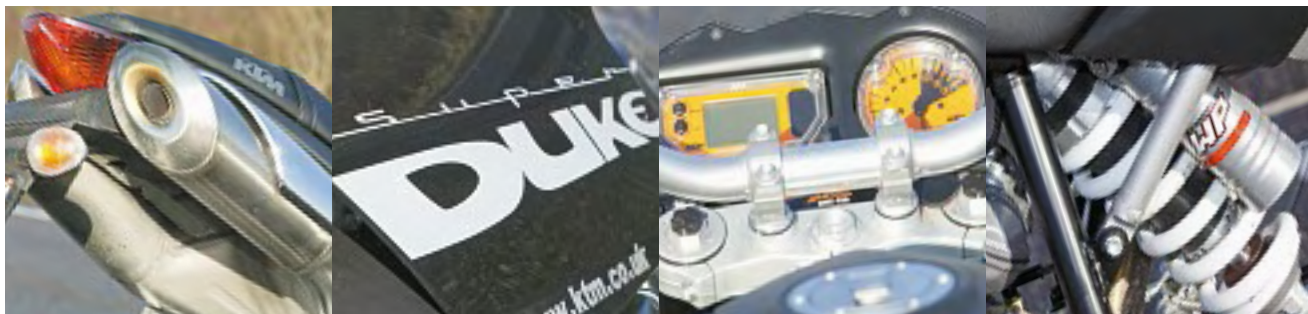
TWIN underseat cans - warn your pillow