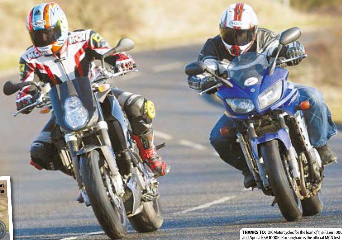
WIND blast makes riding the Super Duke (left) over distance a pain

THANKS TO: DK Motorcycles for the loan of the Fazer 1000 and Aprilia RSV 1000R, Rockingham is the official MCN test circuit – contact: 01536 500500 or www.rockingham.co.uk