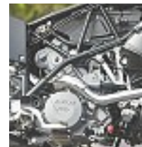
ALMOST 100bhp is provided by the SuperDuke motor

THE 950 Adventure was already an amazing go-anywhere bike, mixing real off-road ability with great competence on the tar. The 990 engine's extra poke and flexibility just makes it better still.