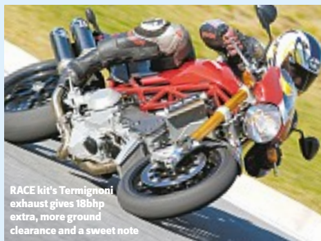
RACE kit's Termignoni exhaust gives 18bhp extra, more ground clearance and a sweet note

The S4RS's Testastretta engine is from Ducati's 999 range which means that there's an awful lot of tuning goodies available if you've got the budget. The best Monster ever could get even better with a slipper clutch, high compression pistons, racing camshafts... and the list goes on.