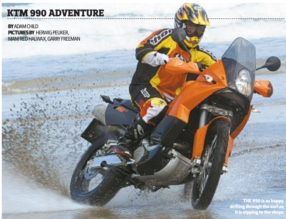
THE 990 is as happy drifting through the surf as it is nipping to the shops