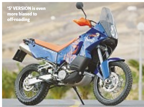
'S' VERSION is even more biased to off-roading

TECHNICAL SPEC Engine: Liquid-cooled 999cc (101 x 62.4mm) 8v dotc four-stroke V-twin. Fuel injection. Six gears. Chassis: Tubular steel trellis frame. WP 48mm inverted forks, fully adjustable. WP single rear shock, fully-adjustable with remote pre-load. Brakes: 2 x 300mm front discs with Brembo twin-piston calipers. 240mm rear disc with twin-piston caliper. ABS (not S-model). Tyres: 90/90 x 21 front, 150/70 x 18 rear.