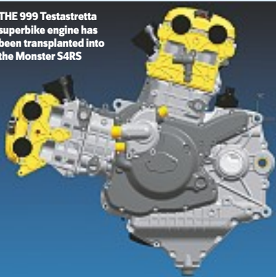
THE 999 Testastretta superbike engine has been transplanted into the Monster S4RS

As for weight loss, the Ohlins rear shock is half a kilo lighter than the S4R's, and, because of carbon fibre panels (exhaust shields, side panels etc), the S4RS comes in at over 4kg lighter than its predecessor.