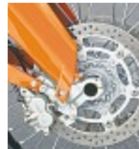
BREMBO ABS brakes are very confidence-inspiring